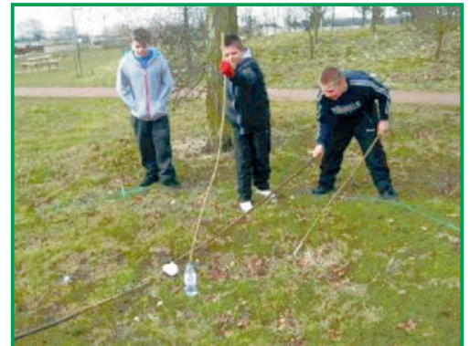
Forest School Challenge

The Forest of Mercia, in conjunction with Groundwork, organised a series of training days for pupils from middle schools in South Staffordshire. There were several long running projects on the go at any one time and some additional one-day activities as well. Students enjoyed the hands on approach and it was very pleasing that the participants were able to complete a coracle and float it, showing that it could take 100kg of weight. Part of the success of the Project was that people with varying backgrounds and from different schools were able to get on together and work as a team.