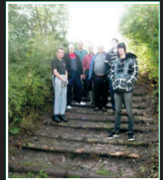
Common Ground volunteers and the steps they have constructed at Christianfields, Lichfield

Other jobs that the Common Ground Team has completed include footpath clearance, stile repair and hazel coppicing to produce bean sticks and plant supports. They have also done weeding around the growing young trees planted at Muckley Corner Common and in the future will hopefully be helping with the installation of a pond on the site. The group enjoy the sessions as it is something a little different from what many of them have done in the past and the variety of tasks on any one day means that people can work at their own rate and level of ability.